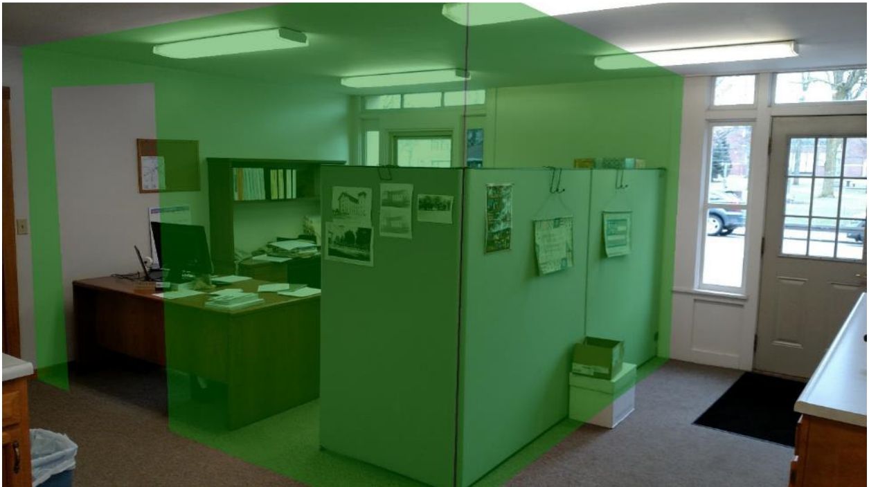
Proposed Finance Director Office – Note overhead light fixtures to be relocated into the new corridor.