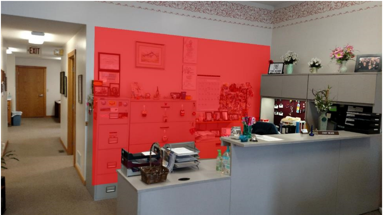
Proposed Wall Demolition Between Clerk and Administrative Assistant Offices – Approximate height is 9 feet.