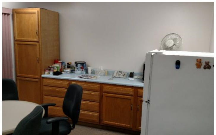
Proposed City Manager Office – Sink and cabinets to be relocated. Soffit to be removed. Walls repaired as needed.