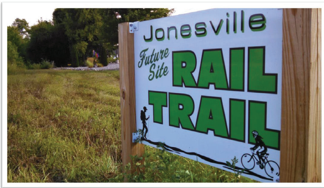
Jonesville Rail Trail